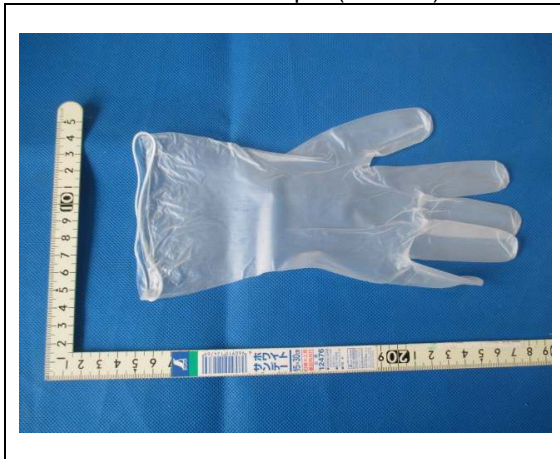
Received sample (size XS)