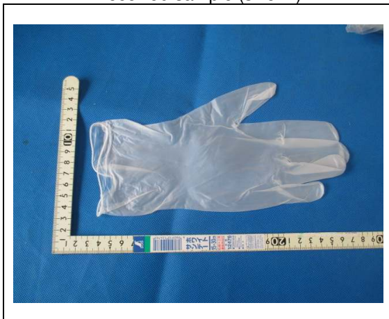
Received sample (size M)