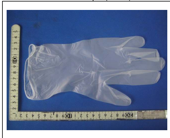
Received sample (size S)